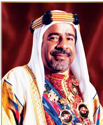
His Highness Shaikh Isa bin Salman Al Khalifa Late Amir of Bahrain