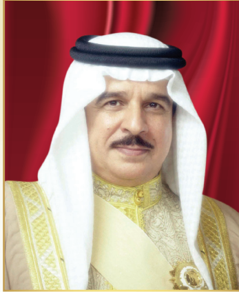
His Majesty King Hamad bin Isa Al Khalifa The King of the Kingdom of Bahrain