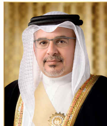
His Royal Highness Prince Salman bin Hamad Al Khalifa The Crown Prince, Prime Minister